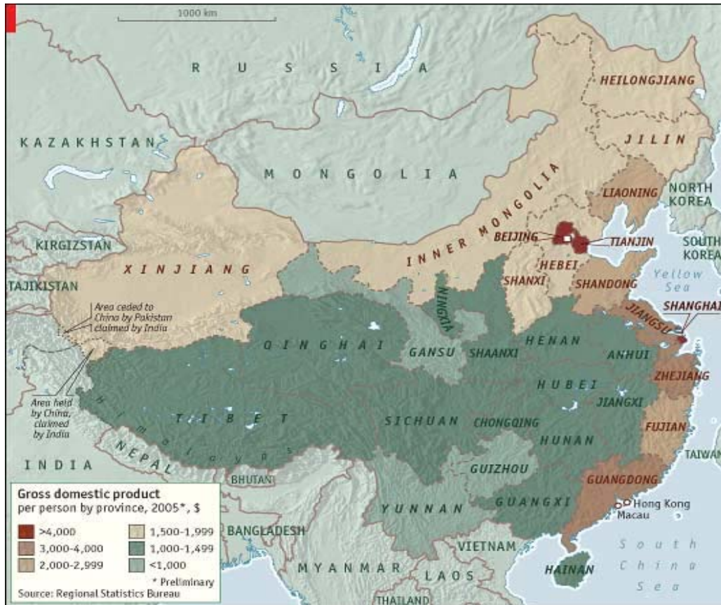
Appendix A: Map 1: Chinese provinces